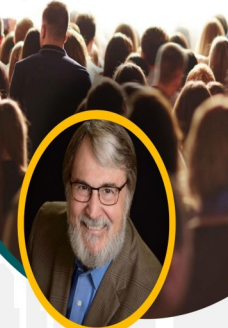
DAN WINKLER Minister and Writer